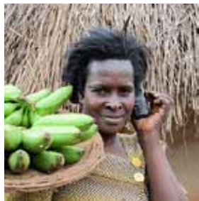
Farmers can use mobile phones to make market decisions.

The number of mobile phones in use in Uganda has increased from 776,200 to over 8.5 million in the past five years. Within the Kamuli district roughly 42% of rural farming households now own a mobile phone. These phones hold tremendous potential to assist small farm operations become more successful and efficient. This study aimed to identify how mobile phones are being used currently, as well as determine how they might be used in the future. 110 individuals were interviewed, representing males and females from six