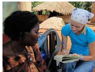
Assessing women's nutrition and health status

Severe malnutrition is a major cause of mortality in pregnant women in sub-Saharan Africa. Research investigating the impact of food insecurity in rural Uganda is limited and little is known about the dietary practices and obstacles faced by pregnant women in this area. This study was performed to address this lack of information and pave the way for future studies to improve the nutrition and welfare of women in Kamuli District.