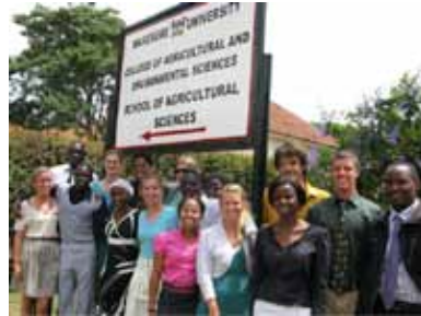
2011 Service Learning Students

As in past years, the team stayed together in Kamuli and invested much of their time aiding and implementing program activities at three primary schools in the area. The School Garden Program allowed students from Iowa State and Makerere University to work side by side with students from Namasagali Primary School to create viable school gardens. These gardens are useful as outdoor learning labs, helping the young students learn valuable farming skills to bring home to their families, and also provide nutritious food to supplement students' diets. One of the principal achievements of the program this year was support for expanding the school lunch program. In addition to helping establish and care for the school gardens, service-learning students harvested crops from the garden and used them to prepare a nourishing meal to serve to the primary school students each day.