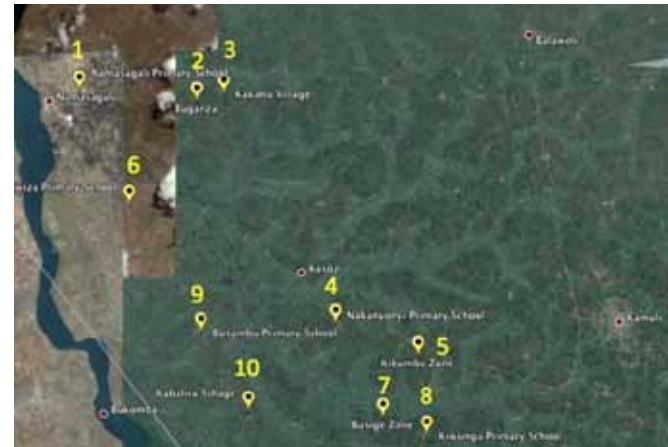
Locations of the 8 installed and 2 planned boreholes in Kamuli district. The Nile River is on the left; Kamuli Town is on the right.

Another challenge is that some of the boreholes have experienced declining water quality and water pumping efficiency. This is due to metal pipes rusting and developing leaks as they age. To overcome this problem, 7 boreholes were serviced this year to replace the original metal with new PVC pipes and stainless steel water-lifting mechanisms. These materials are more expensive, but will last much longer and alleviate problems associated with metal deterioration. PVC pipes will be installed with all new boreholes. Lack of necessary maintenance has occurred even though community leaders have been trained how to care for and maintain their boreholes and the District Water Engineer is responsible for maintenance and repair. To address this issue, we are working more closely with each community to build their capacity to manage their own boreholes. Communities also are required to create community water and borehole accounts to ensure funds are on hand when needed for borehole maintenance and repairs.