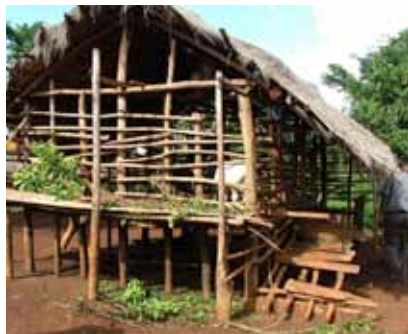
Goat enclosure supported by the Monsanto project.

Activities related to the livestock production and health program continued to expand in 2011. The focus for this past year has been to increase the number of livestock operations and improve the quality of those already established. The farmer-to-farmer approach used in other aspects of CSRL's activities in Kamuli were at work here as well. It is the primary