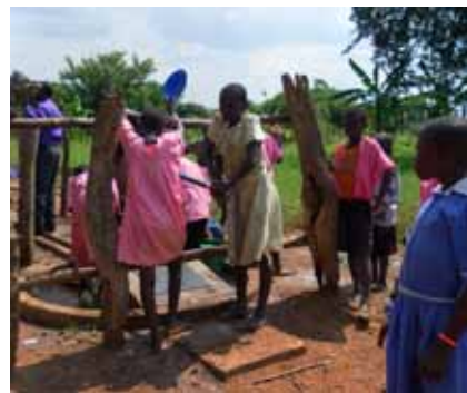
Students eagerly try out the new school well

As with most water projects, there are challenges that need to be addressed. One is that a single borehole is not always enough to meet the needs of a densely populated community. We are currently identifying locations where secondary boreholes might be installed to ease the burden on existing boreholes and provide easier access to water in these communities.