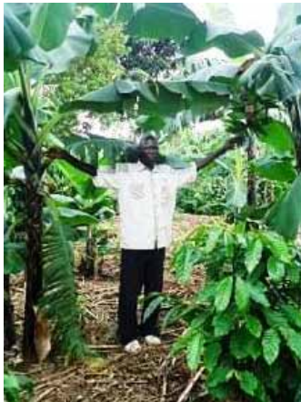
A local farmer takes great pride in showing off his thriving farm

One major indicator of increased food security among farm communities is a significant increase in the amount of land owned and cultivated by the average household. When CSRL first established training activities in Kamuli in late 2004, the majority of farmers were actively cultivating less than 2.5 acres of land. Just two years after the institution of programs for educating and supporting farmers, more than half of program households had increased their planting area to 3 acres or more. The increase in land under cultivation is a strong predictor of household food security because it can increase the availability of food and income.