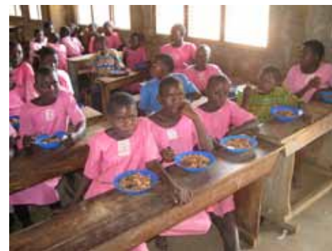
Students enjoying their lunch

gains recorded for the majority of students involved, and mentally - with teachers reporting their pupils more alert and involved in the classroom. Students eagerly anticipate the lunch hour and are more likely to remain in the classroom for the entire school day, rather than leave to look for food. Increased attendance has also been noted, with students regularly coming to school five days a week rather than missing days. One student, while talking with his classmates, told them “Tomorrow I will not miss school because I know I will eat ‘nyoyo.’” Although the new meal seemed strange at first, the students have embraced it and report that they enjoy it more than the porridge meal. So far, our results are overwhelmingly positive and indicate that the new lunch program is helping students stay in school and enabling them to learn more while they are there.