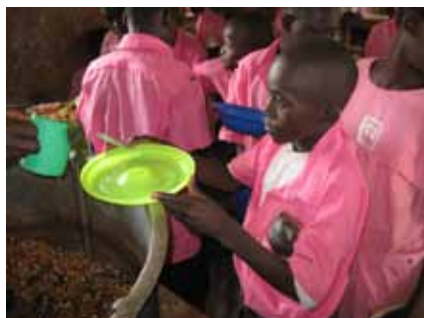
A student receiving a helping of nyoyo

The new program aims to alleviate short-term hunger among students by providing a more nutritionally and calorically dense meal during the school day. The meal developed in cooperation with Makerere University and VEDCO is called “nyoyo,” a traditional dish served in the neighboring country of Kenya. It is a mixture of maize and beans, cooked in a pot with oil and vegetables, and sometimes meat. Serving nyoyo for school lunch has many benefits for the students beyond its superior nutrient and caloric content. The ingredients are inexpensive and readily obtained from local sources. In fact, many of the ingredients are grown by the students themselves as a part of the school garden program! Boiling the maize and beans together in one pot is also easier and more cost- and energy-efficient than traditional ways of preparing maize and bean meals in Uganda, where maize is generally milled into flour and then served with a sauce made from beans.