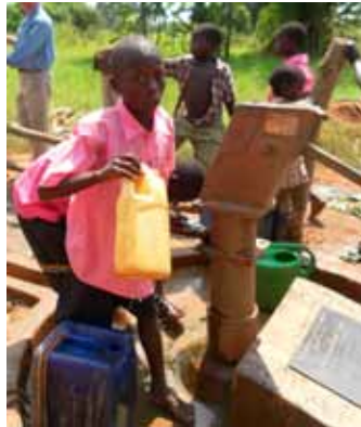
A student fills a jerrycan at the school borehole

Access to clean water is fundamental to achieve food security and improve livelihoods in rural Africa. Clean, safe, and readily accessible water is essential for drinking, cooking, maintaining healthy livestock, and irrigating home gardens. To address this facet of sustainable livelihoods, CSRL partnered with VEDCO to pioneer a borehole-drilling program in 2006 with the goal to provide a clean water supply for local communities and their local primary schools. Thus far, the project has focused on communities with the greatest need in Butsani and Namasagali subcounties just to the east of the Nile River. As of 2010, the program has installed 8 boreholes that service over 1,000 households and over 2,300 primary school students, providing more than 150,000 liters of water each day. Donations to CSRL currently support drilling two boreholes each year- one for a community and one for the primary school associated with that community. The District Water Engineer is commissioned to conduct the hydrological survey to determine the most suitable locations for drilling new boreholes and to supervise their drilling and maintenance.