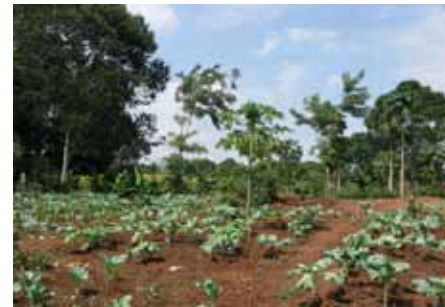
Eggplants in the Nakanyonyi school garden

The students also branched out from the school gardens and invested time within