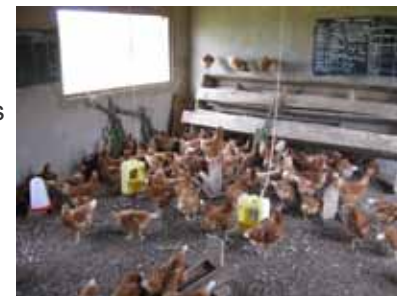
Healthy chickens inside an enclosure

school teachers about poultry production and provides ongoing technical support for the program. Under the teachers' guidance, students help care for the animals and learn about husbandry in the process. Some of the eggs produced are used to supplement the school lunch program with increased protein and to purchase food items such as beans, oil, and salt. The rest are sold to buy feed for the poultry and offset production costs. The success of this program has encouraged CSRL and VEDCO to expand the program to other schools.