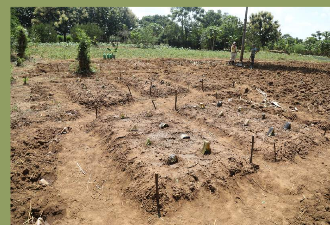
Fig 3. Raised treatment beds