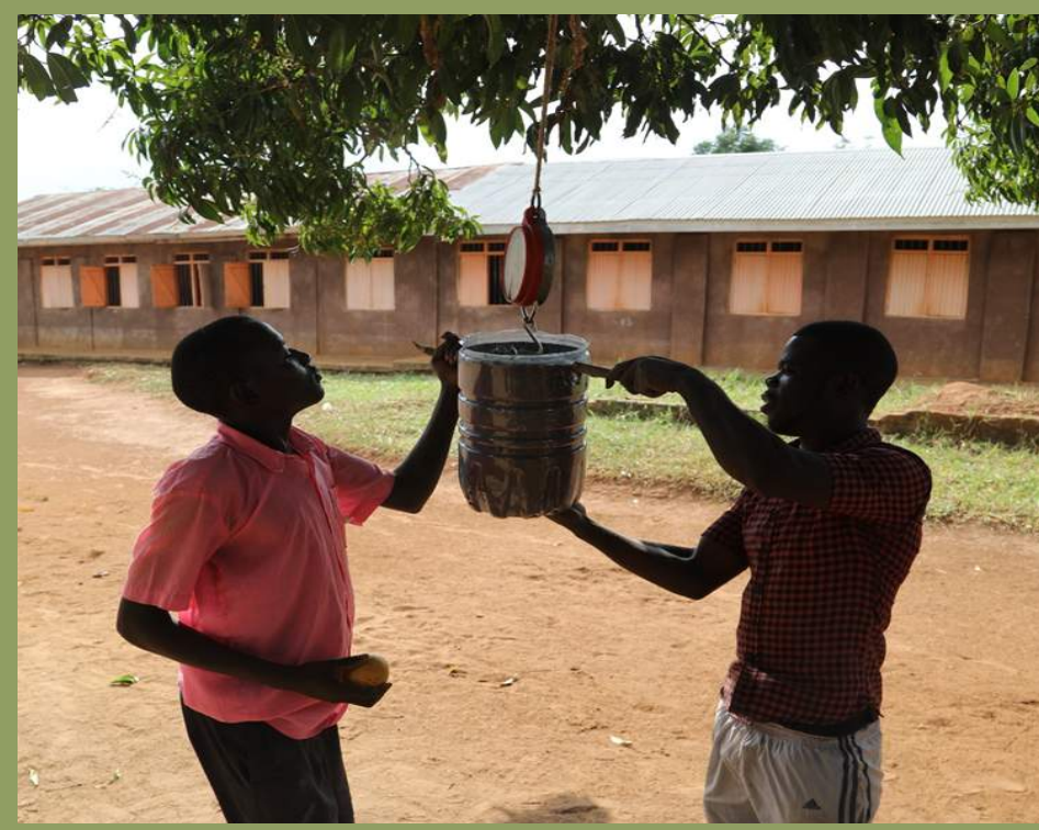
Fig 1. Measuring compost