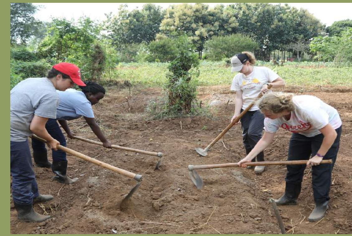
Fig 2. Incorporating chicken litter