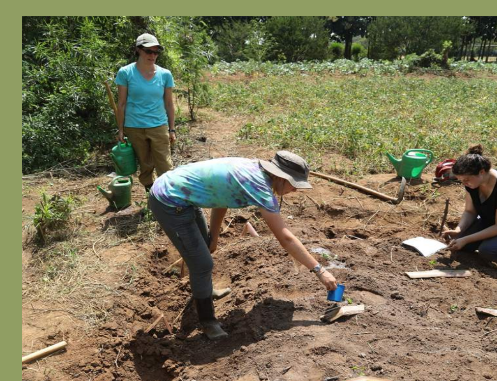
Fig 4. Watering the collards